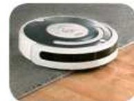
Adjusts to clean any type of floor surface