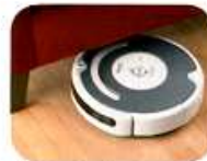
Navigates to clean right under low furniture

For more information on iRobot Roomba call 0800 132 509