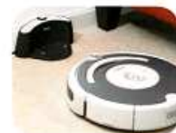
Automatically returns to homebase to recharge