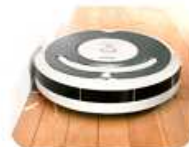
Cleans along edges and in tight corners