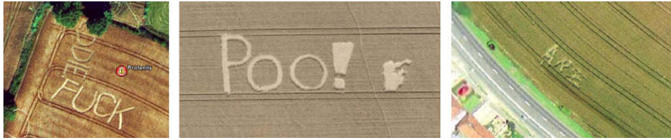
Fig. 4. Google Earth illuminated profanities. (Lines of Flight: http://www.theregister.co.uk/2006/02/09/profanity.kmz ; http://regmedia.co.uk/2007/01/08/scots_say_poo.kmz ; http://regmedia.co.uk/2006/05/31/huge_arse.kmz ).