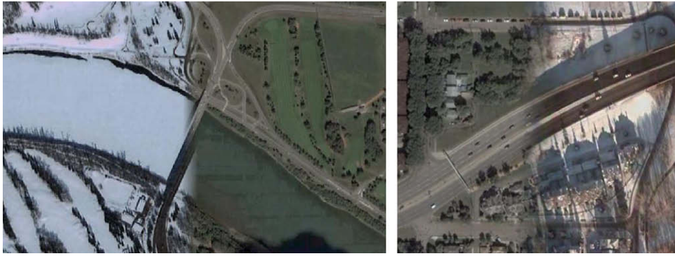
Fig. 6. “Unsurprisingly, special care is required when negotiating the city’s roads, since driving conditions can change dramatically in seconds”..