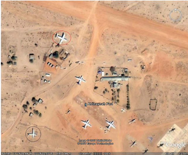
Fig. 5. Google Earth shot of Geneina Airport, Darfur. The damaged planes are circled. (Line of Flight: http://regmedia.co.uk/2007/05/30/geneina_airport.kmz ).

“The UN photo shows the left wing grounded and the right wing up in the air. The red circled plane has its right wing grounded whereas the black circled plane has its left wing grounded. Does this not suggest the black circled one is the more likely of the two to be a match?”