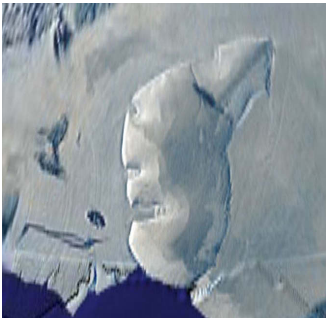
Fig. 9. An angel of geography? (Source: http://www.theregister.co.uk/2005/10/14/google_earth_competition_results/page5.html ).

ical destruction of Planet Earth. How so? We wonder if the face, partly an exposure of snow and ice, is the result of one of the storms of progress we call global warming. And how will the face metamorphose in the future? Will it melt and disintegrate, only to be washed over with newly-formed debris resulting from rising sea levels? We do not know the answer to these questions, but amidst these speculations on Google Earth, we take heart in Oscar Wilde's (2000, p. 24) reminder that it is "only shallow people who do not judge by appearances. The true mystery of the world is the visible, not the invisible".