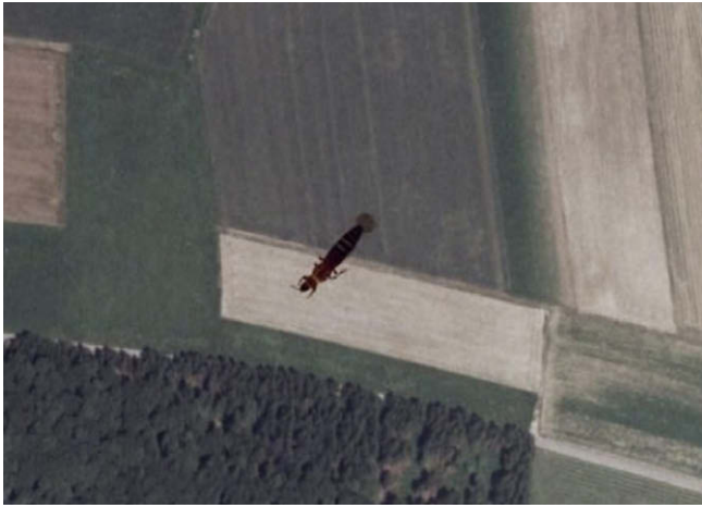
Fig. 2. 50 meter long insect near Hülen, Baden-Württemberg, Germany. (Line of flight: http://regmedia.co.uk/2006/09/28/giant_earwig.kmz ).