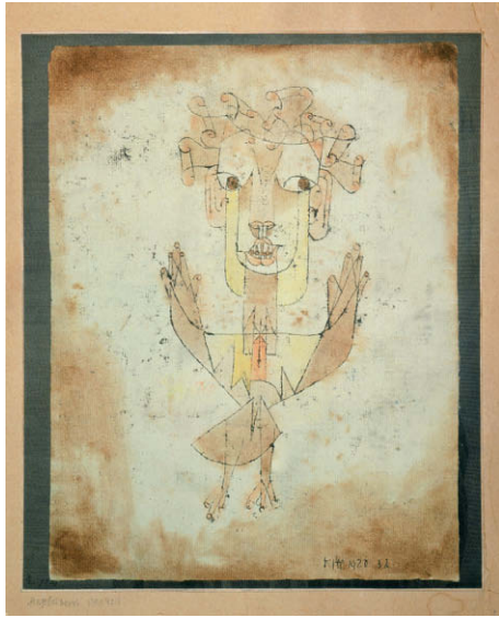
Fig. 8. Angelus Novus (1920) by Paul Klee. India ink, color chalks, and brown wash on paper. (Source: Reproduced with kind permission of The Israel Museum, Jerusalem. ©Estate of Paul Klee/SODRAC).