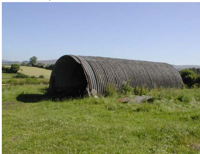
Land Army Tractor Base Castle Hill Farm