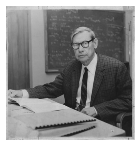
Marshall Harvey Stone

(iii) is the key statement: The natural transformation \mathcal{V} is an isomorphism by the representation theorem 3.1.5 for Boolean algebras. The natural transformation \Theta is an isomorphism by the representation theorem 3.1.6 for Boolean spaces.