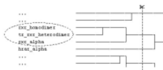
Figure 1: Producing clusters by cutting off the subtrees

We further introduce contextual similarity , where frequently used context patterns in which terms appear are used for comparison. These patterns are domain-specific, but are learnt automatically from a corpus by pattern mining. Context patterns consist of the syntactical categories and additional lexical information, and are used to identify functionally similar terms.