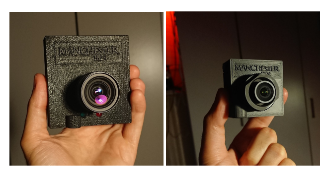
Figure 1. SCAMP-5 system vs SCAMP-7 system.

Our new SCAMP-7 vision system builds upon its predecessor SCAMP-5 [2], with revised silicon chip implementation providing increased light sensitivity, greater digital memory per processing element PE, and various other improvements such as more accurate global analog summation. The system as shown in Figure 1 has also a smaller footprint than the older SCAMP-5 camera system, due to integration of a larger amount of peripheral circuitry onchip. If possible we would bring demonstrations for a number of applications performed entirely with "in-pixel" processing. Programming techniques for processor arrays are different from that for serial processors - in all these examples, we show how the IC can output data regarding an image, without necessarily outputting the image itself (the image is only output to aid understanding of the demonstration). The program development environment will be demonstrated alongside discussion of specific programming techniques for pixel parallel processor arrays and the new features of the SCAMP-7 device.