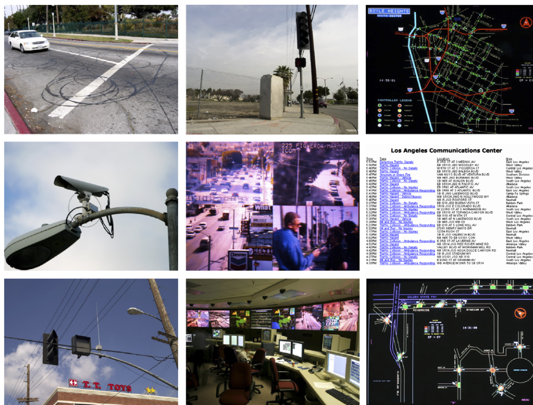
Fig. 3. A montage of images of software-driven technologies that automatically manage the road infrastructure in Los Angeles.

transponders), car-parks (swipe cards and smart meters), and those that seek to regulate access to the system as a whole such as government agency systems that keep track of capta on driver licenses (and any penalties) and vehicle tax payments, and in insurance systems that note whether a driver has insurance cover and calculates rates on the basis of risk. In both cases, software-enabled technologies ensure differential access on basis of certain criteria, usually identity or ability/willingness to pay, and thus ensure that the road infrastructure is appropriately segmented; those who are entitled have access to right parts of the system and those who do not are excluded. In many respects, the improved capability offered to 'police' the roads to exclude the uninsured, unlicensed and disqualified drivers is sensible with respect to road safety. Such drivers are deemed to be disproportionate accident risk (see DfT, 2004b, for data on the UK). The systems are sold on the basis of making driving more secure, safe and law-abiding.