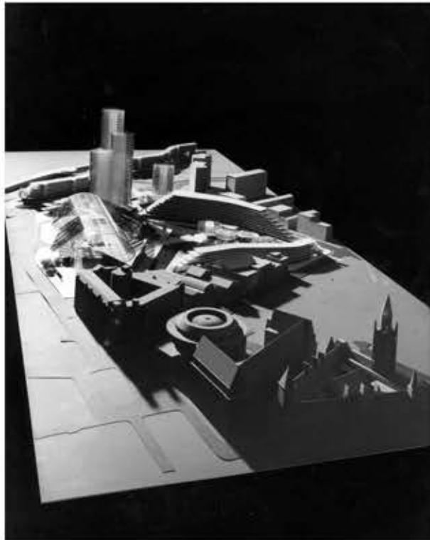
Central Station designs by Cruickshank & Seward

During the 1960s a vision of Manchester was being drawn up by property developers and town hall planners that only existed in architects drawings and consultant's reports and was never realised in concrete and steel. Manchester was booming and vast swaths of the city centre were scheduled for redevelopment for entertainment, shopping, education, office complexes and transportation. But as with many masterplans, only portions of what was designed were actually built. In this exhibition, for the first time, visitors will be able to encounter the 'unmade city' – the masterplans as they were intended to be. With guidance from the curators, five teams of Masters students from the Manchester School of Architecture have drawn from detailed maps, plans, sketches and archival sources to design and build 3D models of parts of the city that can be navigated using game controllers.